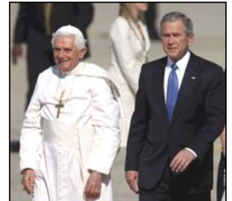
Ratsinger the High Priest of Rome received by Bush - "the King of the North", 4-08

"And the woman (The Whore of Babylon) which thou sawest is that great city (Rome) which reigneth over the kings of the earth." -Revelation 17:18