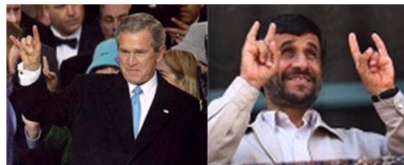
Bush, Ahmadinajad: On the same Illuminati team?